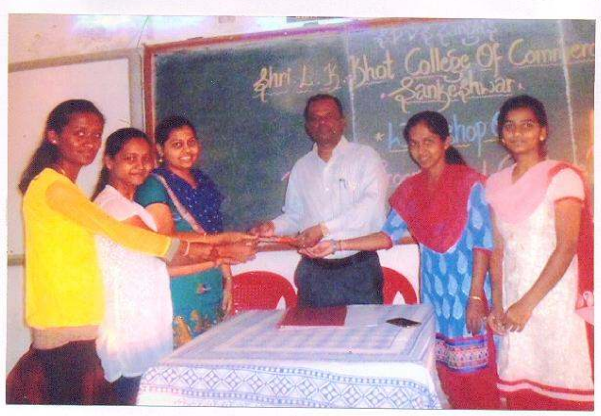
Rewarding winners in Activities