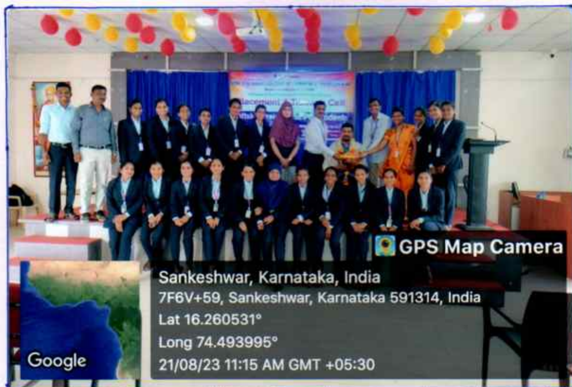
Group photo with the trainer along with the president, co-ordinator & Students.